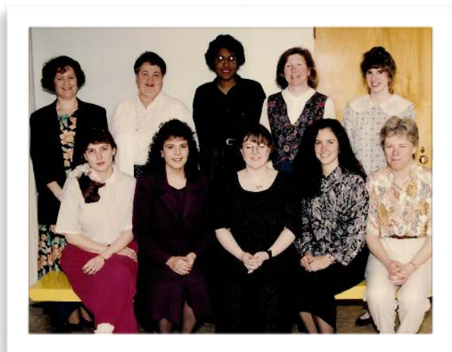
The old crew

We have what we call "the old crew" at The Moncton Hospital. We all started together, had kids together supported each other in happy and sad times. This has certainly been one of the sad times. We thought it only fitting that each of us write something about our friend and colleague.