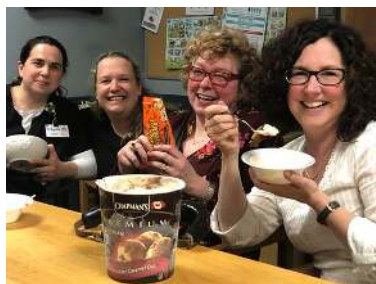
Ice cream social at TMH