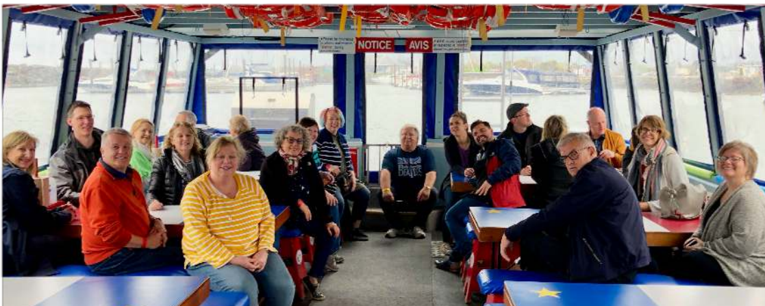
CAASPR Board of Directors and Registrars enjoying a dinner cruise in Shediac Bay after meetings in early June.