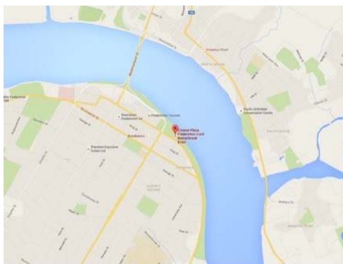
Crowne Plaza Lord Beaverbrook Hotel, Fredericton, NB

See NBASLPA.ca for registration form and further details.